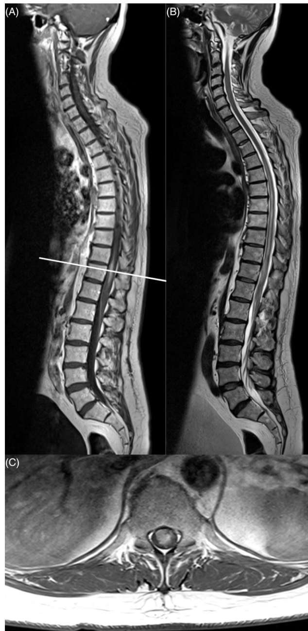
Figure 1: Sagittal T1-weighted post-contrast MRI spine from his initial hospitalization for spinal cord symptoms (A) revealed an enhancing focus centered around T11. Notably, there was no leptomeningeal enhancement or any bulky enhancing disease. There was T2-bright cord signal change (B) from T4 through to the conus. Axial T1-weighted post-contrast images (C) showed that the lesion was intramedullary. Given the clinical context, these images were diagnostic of spinal intramedullary glioblastoma metastasis.

prolonged survival (7.7 months) compared to chemotherapy alone, radiation alone, or palliative care. 9