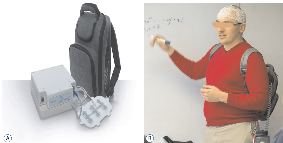
Fig. 1. A : TTFields devices. B : A patient wearing TTFields devices. TTFields : treatment method called tumor treating fields.

The cells contain charged particles (such as proteins and DNA), including unipolarity charged polar particles and double-charged dipoles, which are subject to Coulomb forces in the electric field. In the uneven AC electric field, the alternating Coulomb force magnitude or direction of all charged particles is different, and the Coulomb force's clearance effect is